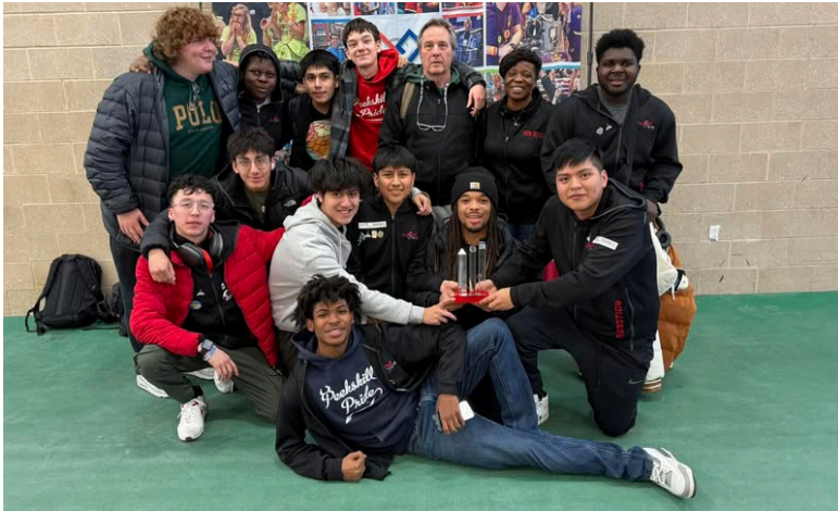
¡Felicitaciones a los Diablos de Hierro! / PHS Iron Devils! ¡Les deseamos mucho éxito en el Premier Championship!