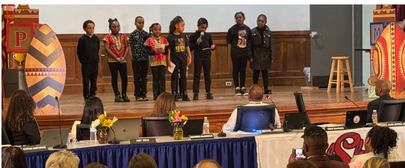
Un grupo de estudiantes de Oakside presentó un poema de Maya Angelou en la reunión de la Junta de Educación esta semana.