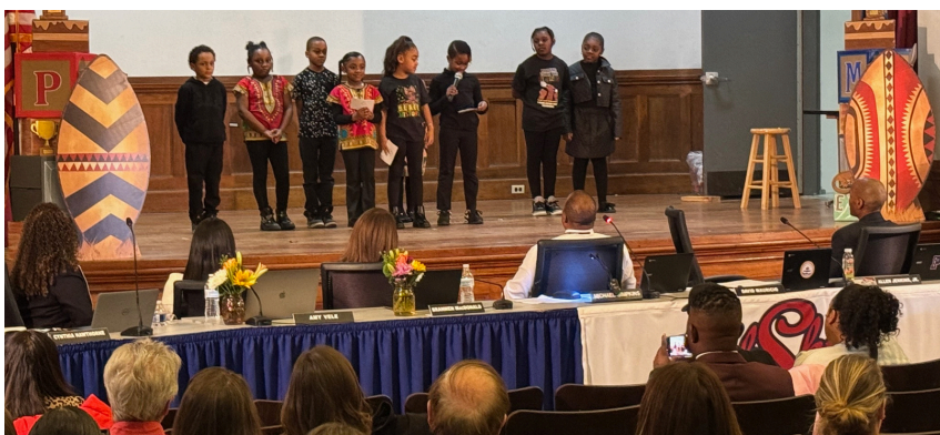
A group of Oakesides students perform a Maya Angelou poem at this week's Board of Education meeting.