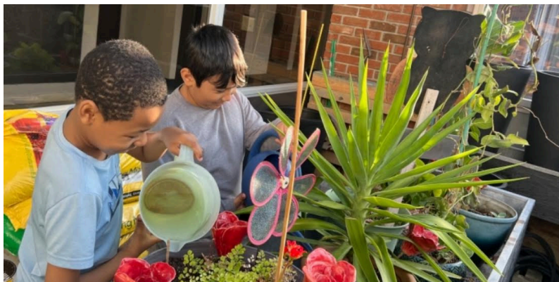
¡Gracias al Rotary Club de Peekskill por su generosa donación al jardín de Oakside! Esta primavera se inaugurará un aula al aire libre.