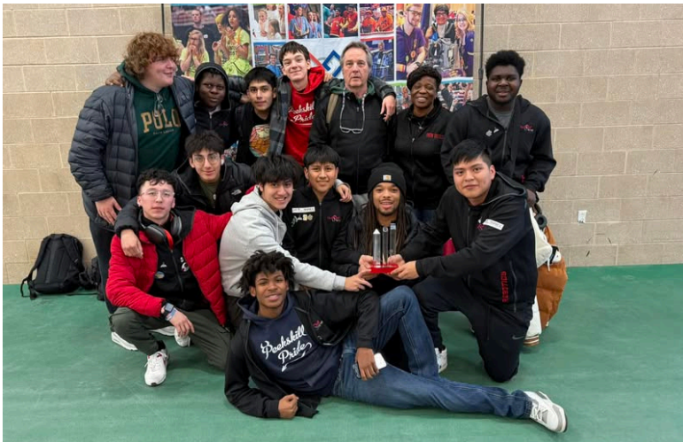
Congratulations to the PHS Iron Devils! Good luck at the Premier Championships!