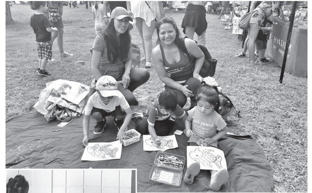
Children color pictures while parents listen to information about the Peekskill Basics program. (Above)